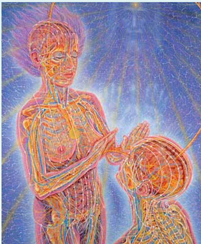
Illustration of "Passes"

that favors the restoration of health – increased natural-killer cells and rebalancing of cytokines, restricting inflammatory processes.