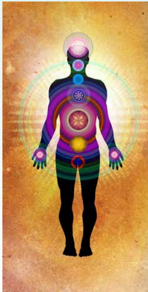
Illustration of Spiritual Body with Chakras

us use the same cosmic fluid, which is in constant circulation through the Universe, for co-creation in a lower level, connecting the corpuscles of matter with the spiritual energy proper to them, thus forming the physiopsychosomatic vehicle in which they express themselves, or creating civilizations that span in the globe both the Incarnate Humanity and the Discarnate Humanity". (Op. cit.)